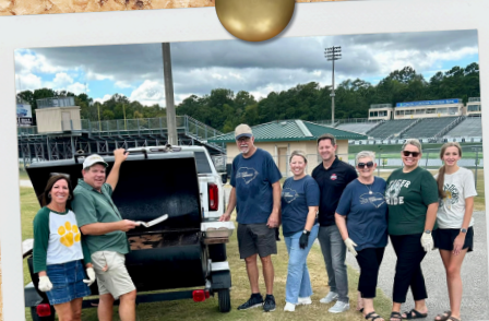
SERVING CONWAY FOOTBALL TEAM