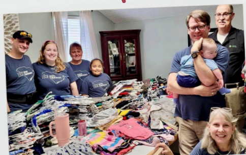
COASTLINE WOMEN'S CENTER