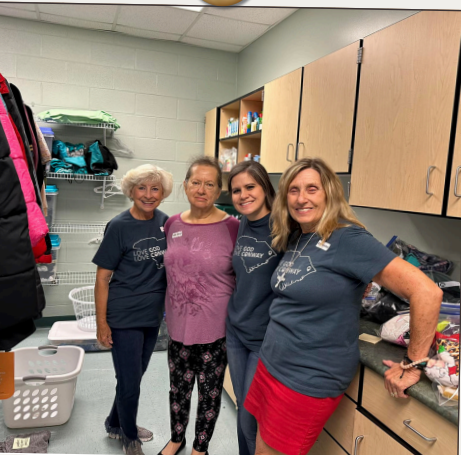
HEART 4 SCHOOLS