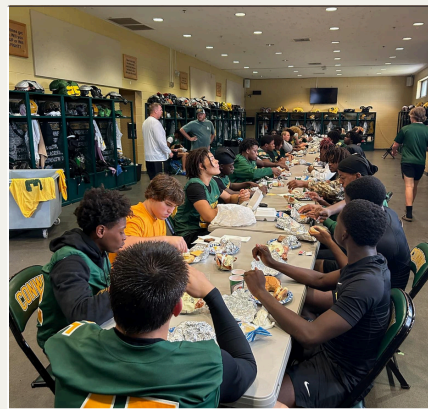
CONWAY H.S. FOOTBALL TEAM