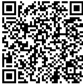
Prayers for the Saints by Sovereign Grace