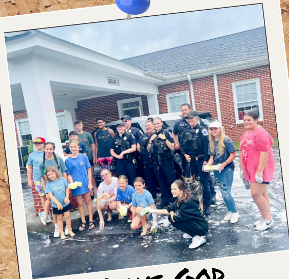
LOVE GOD LOVE CONWAY