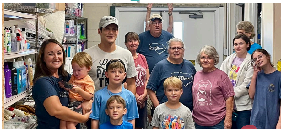
CHURCHES ASSISTING PEOPLE