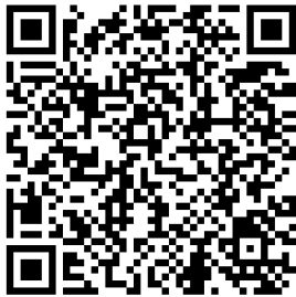
NCBC Worship Music