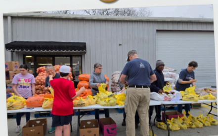
SHEPHERD'S TABLE FRESH EXPRESS