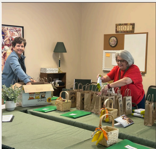
COASTAL SCHOOL MINISTRIES