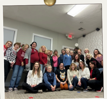
"GRACE SUNDAY SCHOOL CLASS"