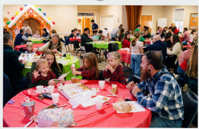
"GINGERBREAD NATIVITY MAKING"