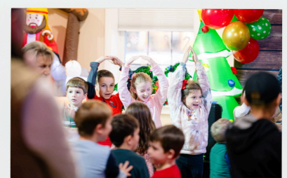
"ENJOYING GINGERBREAD FUN"