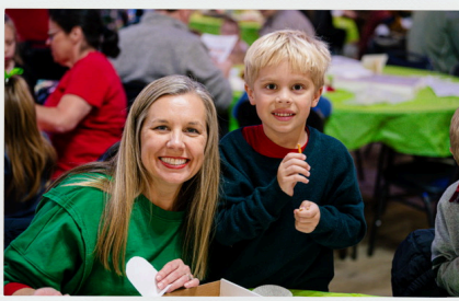
"GINGERBREAD FUN FOR EVERYONE"