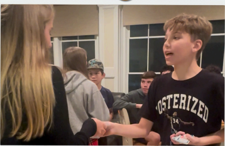
"NCBC STUDENTS CHRISTMAS FUN"