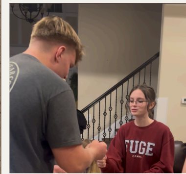
"NCBC STUDENTS CHRISTMAS FUN"