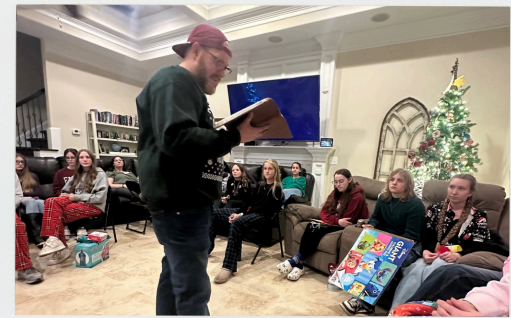
"NCBC STUDENTS CHRISTMAS PARTY"