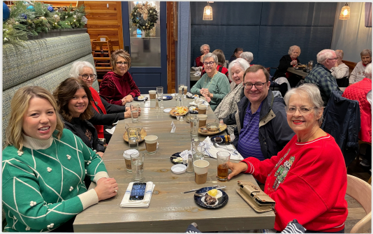
"BRUNCH WITH JOYFUL ENDEAVORS"