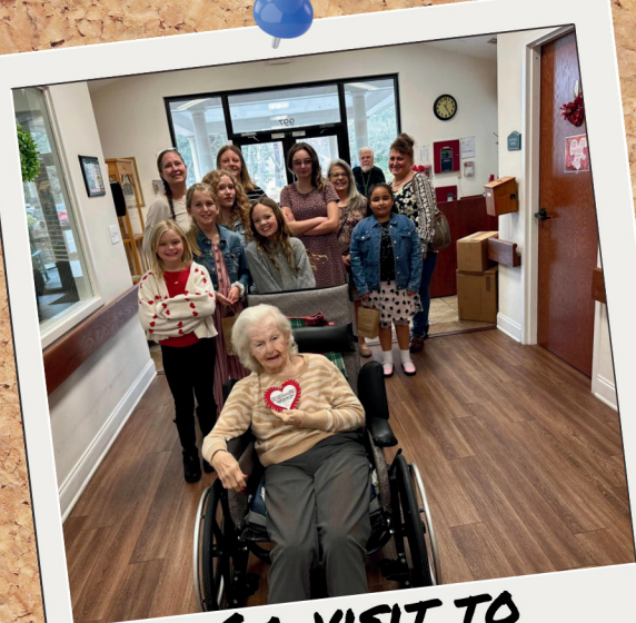
GA VISIT TO ANDERSON OAKS