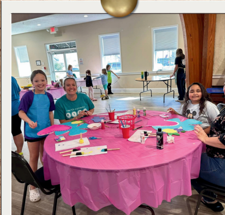
GA PAINT PARTY