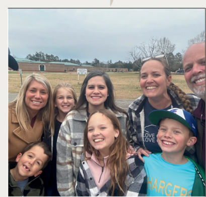
PRAYER WALK CES